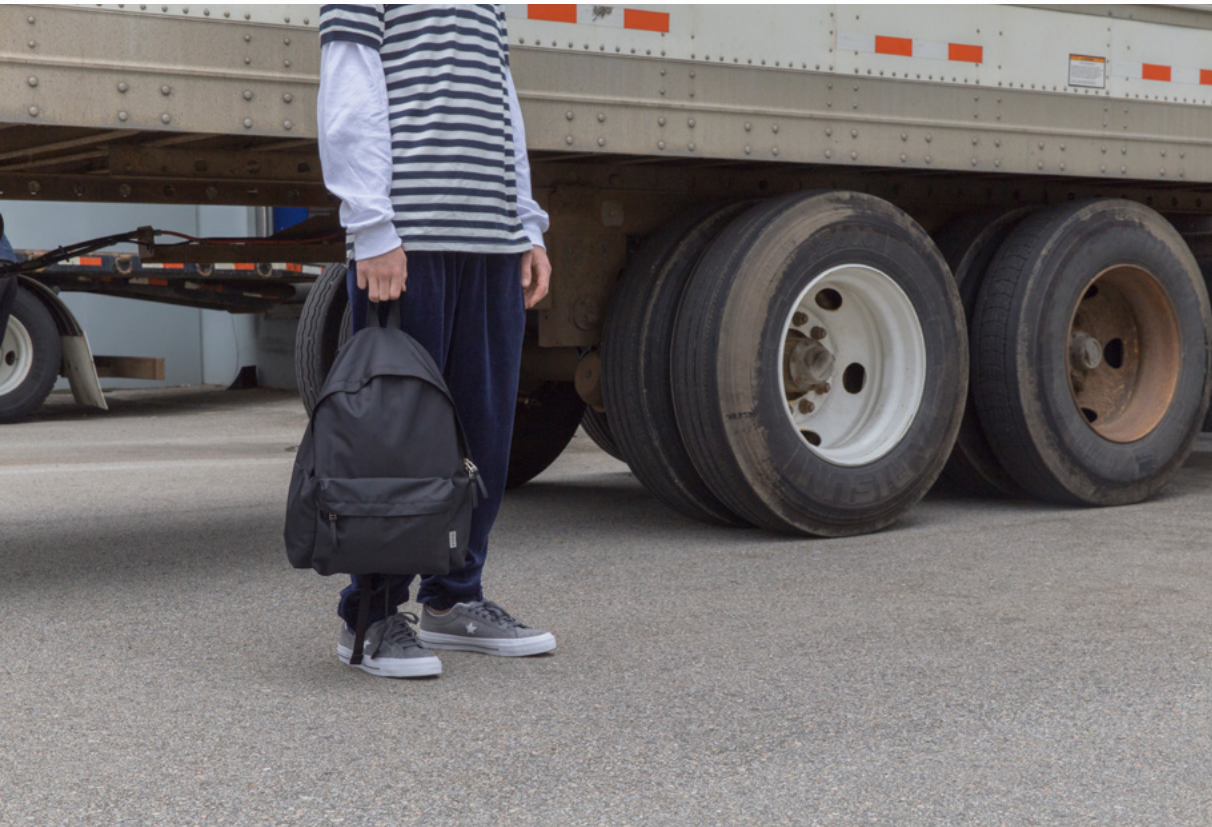
HORNET IN MATTE BLACK 080-1000