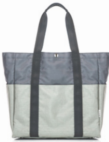
GREY / GREY 2 / 030-6400