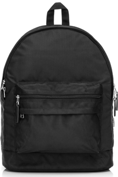
MATTE BLACK 1 / 020-1100

Premium Ballistic Nylon Construction 1 Premium Corduroy Construction 2 Premium Two-Tone Nylon Construction 3 Premium Cotton-Canvas-Italian Veg Tan Construction 4 Premium Italian Suede Leather Construction 5 Black Nylon OX Lining Premium Leather Tassels Multi Storage Solutions External 15" Laptop Sleeve Nickel Finish Zippers & Hardware