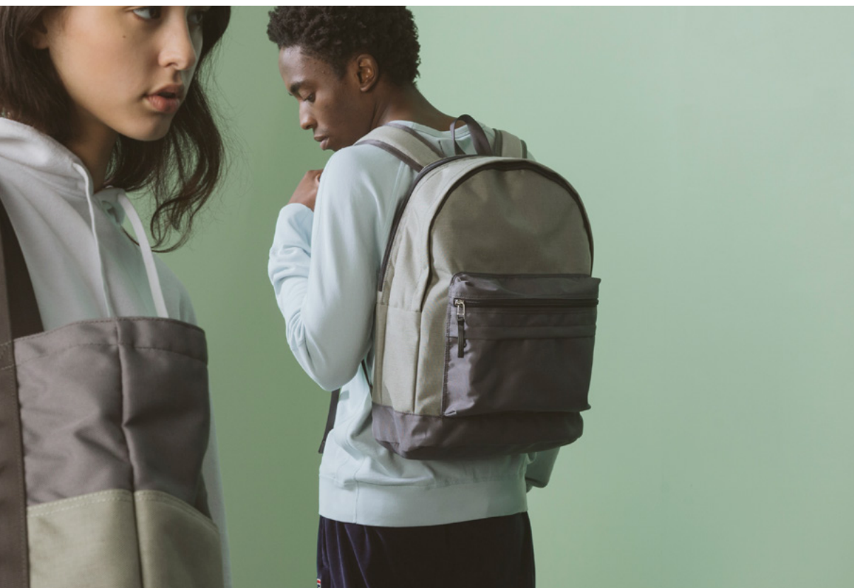
SHERPA &amp; LANCER IN GREY / GREY