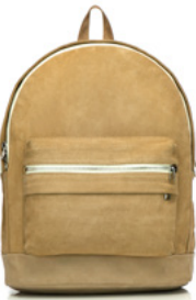
CIGAR SUEDE 5 / 120-2200

SKU 030-XXXX H 15in SKU 130-XXXX W 15in D 6.5in