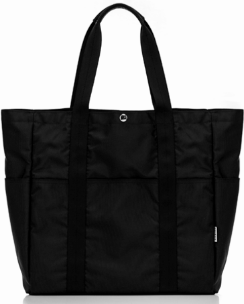
MATTE BLACK 1 / 030-1100

Durable Ballistic Nylon Construction 1 Premium Nylon Construction 2 Premium Two-Tone Nylon Construction 3 Premium Cotton-Canvas-Italian Veg Tan Construction 4 Premium Italian Suede Leather Construction 5 Premium Cotton-Canvas and Leather 6 Black Nylon OX Lining Premium Leather Handles Internal Laptop Sleeve 2 Front and Back Slip Pockets 2 Snap Closure Side Pockets Multi Storage Solutions Nickel Finish Hardware and Feet