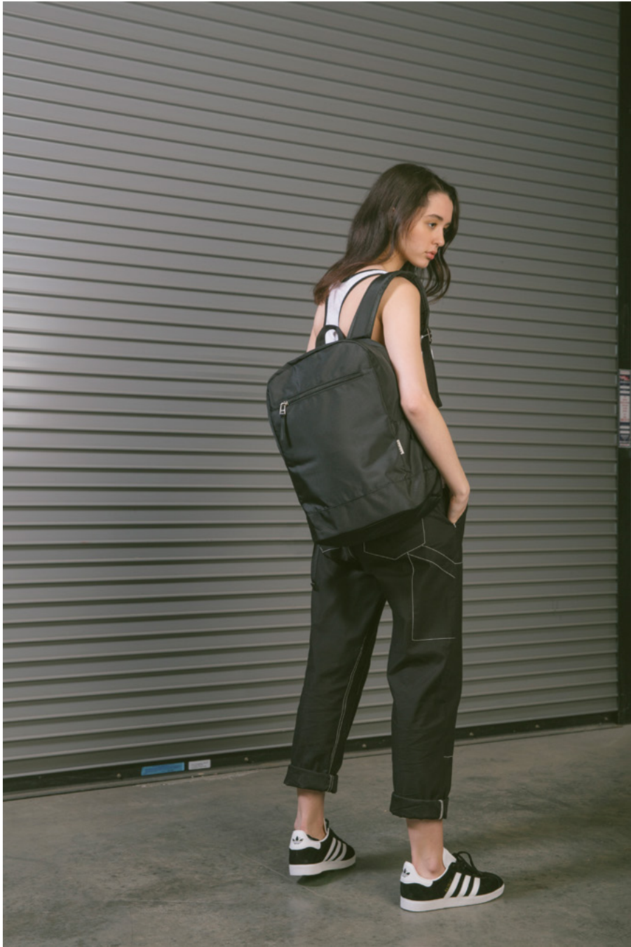
TOMCAT IN MATTE BLACK 060-1100