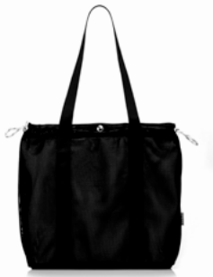
BLACK MESH 2 / 090-1200