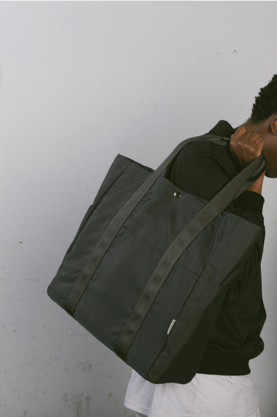
SHERPA IN CHARCOAL 030-1100

Available in Matte Khaki, Charcoal, and Matte Black