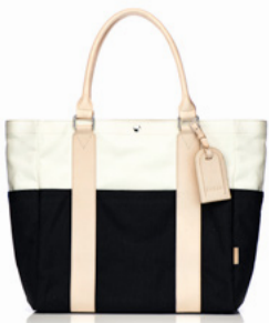
BLACK / OFF WHITE / VEG TAN LEATHER 4 / 130-1000