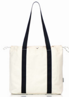
NATURAL COTTON 3 / 090-5200