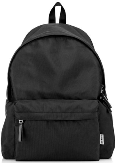
MATTE BLACK 1 / 080-1100

Durable Ballistic Nylon 1 Poly-Mesh Construction 2 Premium Cotton-Canvas 3 Premium Corduroy Construction 4 Ideal Un-Structured Silhouette Multi Storage Construction Internal 15" Laptop Compartment Nickel Finish Zippers & Hardware