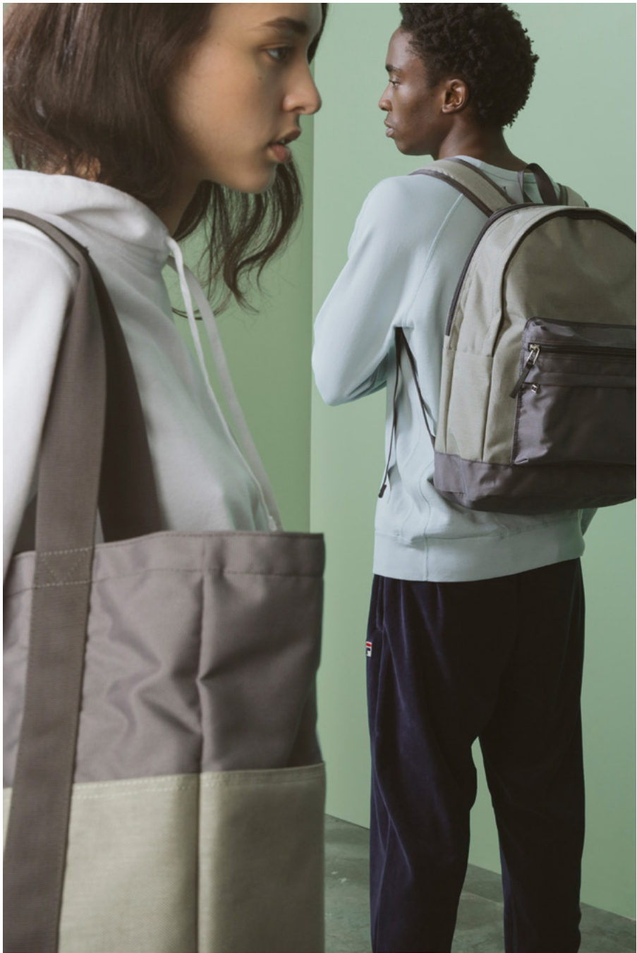
LANCER & SHERPA IN GREY / GREY 020-6400 / 030-6400