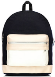
BLACK / OFF WHITE / VEG TAN LEATHER 4 / 120-1000