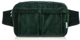
FOREST CORDUROY 2 / 010-3100