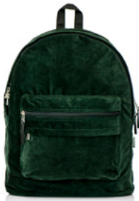
FOREST CORDUROY 2 / 020-3100