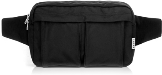
MATTE BLACK 1 / 010-1100

Premium Ballistic Nylon Construction 1 Premium Corduroy Construction 2 Black Nylon OX Lining Interior Multi Storage Solutions External Snap Closure Pockets Nickel Finish Zippers & Hardware