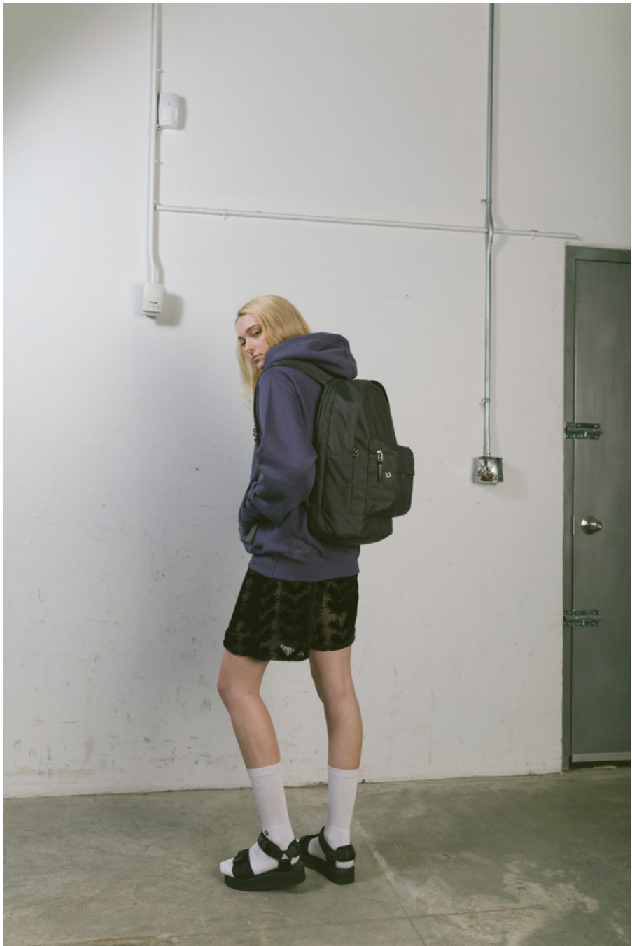
LANCER IN CHARCOAL 020-1100