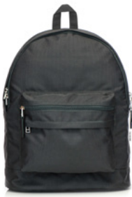
CHARCOAL 1 / 020-6200