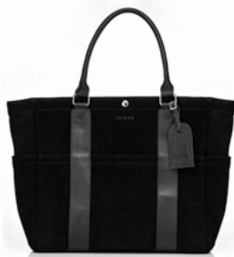
BLACK SUEDE 5 / 130-3000