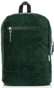
FOREST CORDUROY 2 / 040-3100