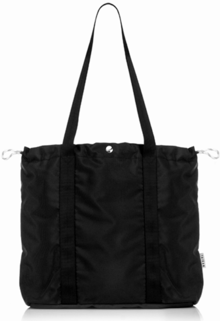
MATTE BLACK 1 / 090-1100

Durable Ballistic Nylon Construction 1 Poly-Mesh Construction 2 Premium Cotton-Canvas Construction 3 Premium Corduroy Construction 4 Dual Drawstring Closure Multi Storage Solutions Nickel Finish Zippers & Hardware