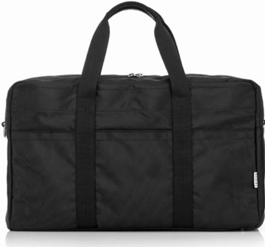
MATTE BLACK 1 / 050-1100