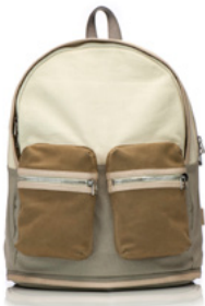
NATURAL COTTON CANVAS / SUEDE / VEG TAN LEATHER 5 / 160-5200

SKU 050-XXXX SKU 150-XXXX H 11.5in W 19.5in D 8.5in