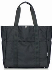
CHARCOAL 2 / 030-6200