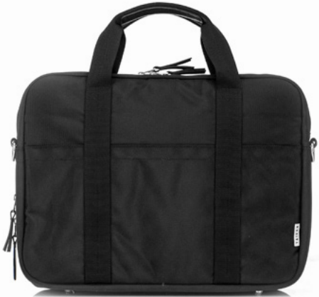
MATTE BLACK / 070-1100

Durable Matte-Finish Ballistic Nylon Construction Black Nylon OX Lining Premium Leather Handles and Tassels Internal Padded Laptop Sleeve Multi Storage Construction Nickel Finish Hardware and Feet