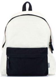
NATURAL COTTON 3 / 080-5200