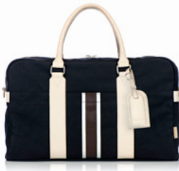
BLACK / OFF WHITE / VEG TAN LEATHER 2 / 150-1000