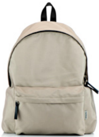
MATTE KHAKE 1 / 080-5100