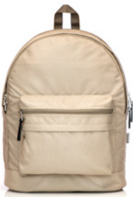
MATTE KHAKI 1 / 020-5100