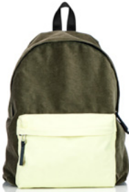
GREIGE CORDUROY 4 / 080-6400