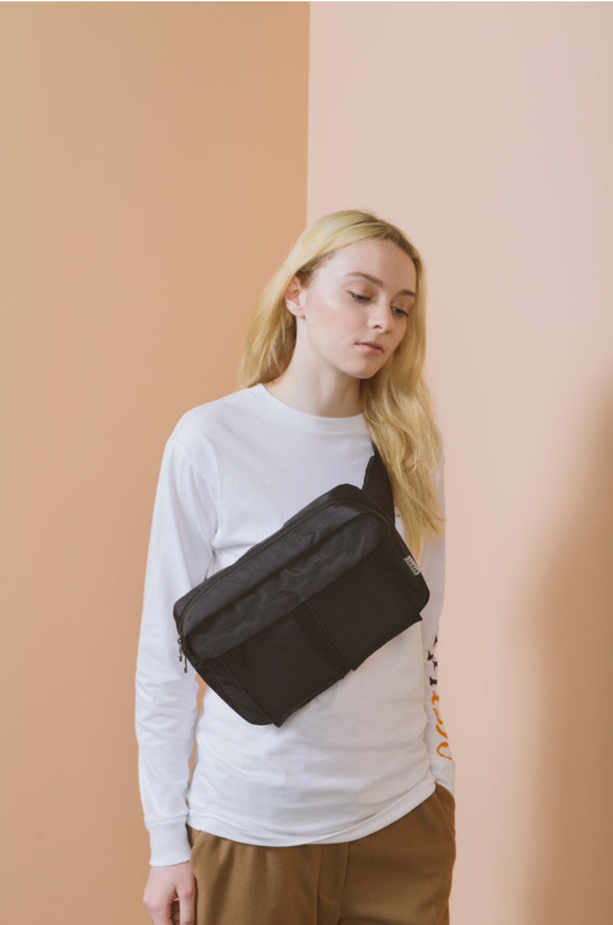
SPECTRE IN MATTE BLACK 010-1100