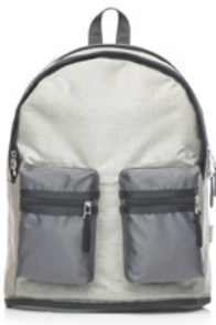
GREY / GREY 2 / 060-6400