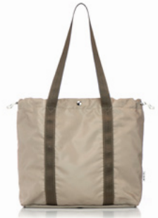
MATTE KHAKE 1 / 090-5100