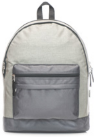
GREY / GREY 2 / 020-6400