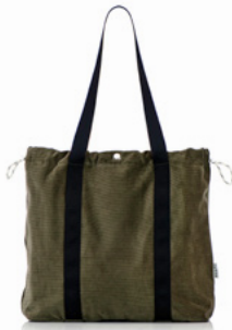
GREIGE CORDUROY 4 / 090-6400