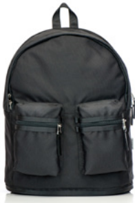
CHARCOAL 2 / 060-6200