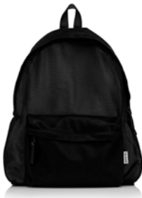
BLACK MESH 2 / 080-1200