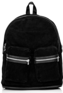
BLACK SUEDE 4 / 160-3000