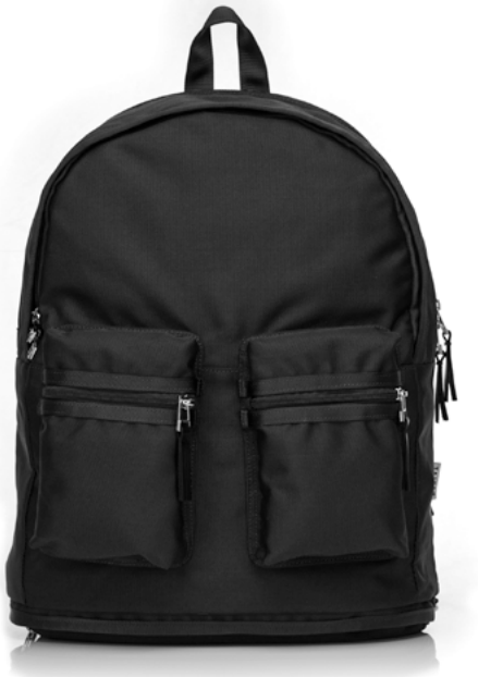
MATTE BLACK 1 / 060-1100