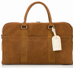
TOBACCO SUEDE 3 / 150-2000