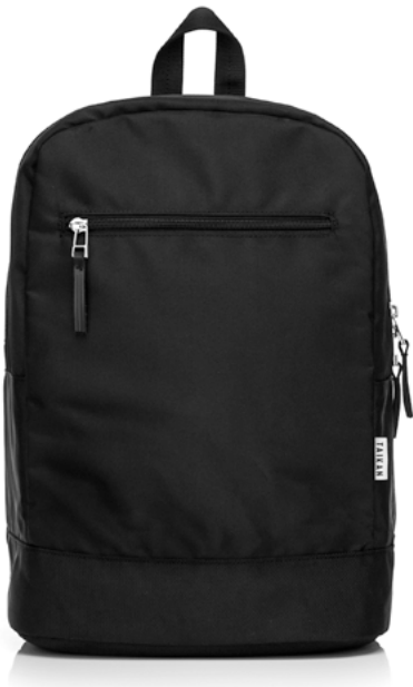
MATTE BLACK 1 / 040-1100