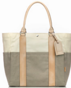
NATURAL COTTON CANVAS / VEG TAN LEATHER 4 / 130-5200