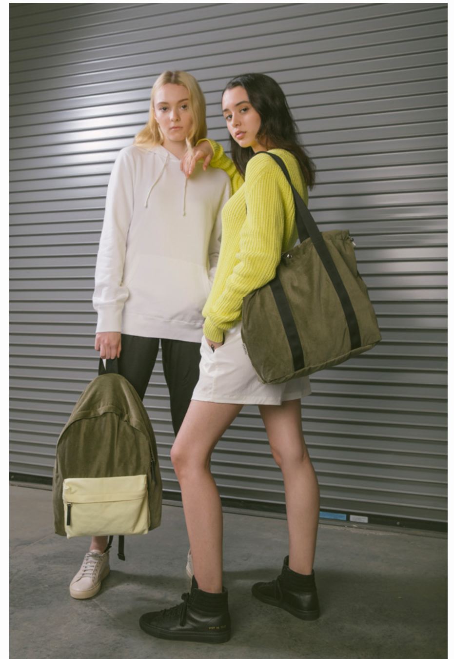
FLANKER & HORNET IN GREIGE CORDUROY 090-6400 / 080-6400

Our HORNET eliminates the unnecessary, with it's simplistic approach to the everyday backpack. With an un-structured silhouette, the HORNET creates the perfect look for work, travel and play. This Corduroy & Cotton-Canvas bag features an internal laptop compartment for easy CPU access, and an exterior pocket for external access.