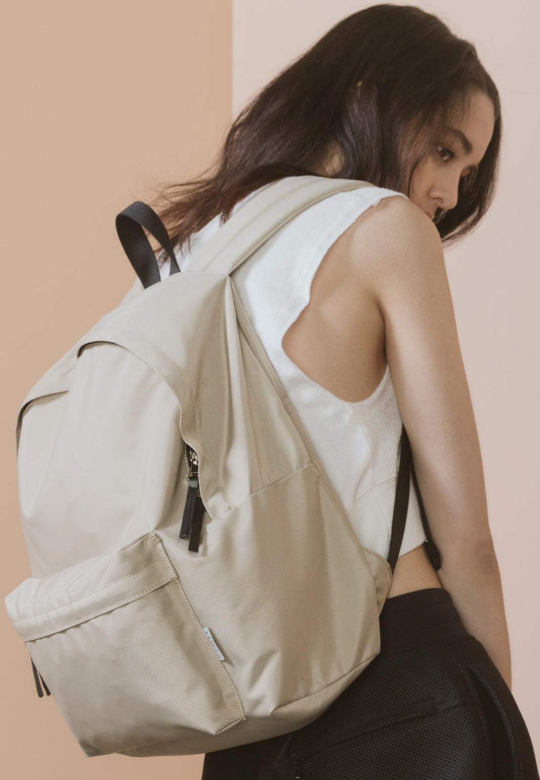
HORNET IN MATTE KHAKI 080-5100