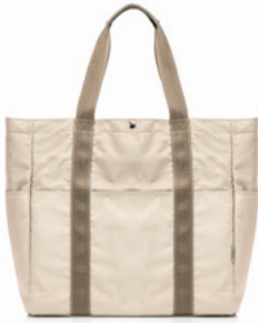
MATTE KHAKI 1 / 030-5100