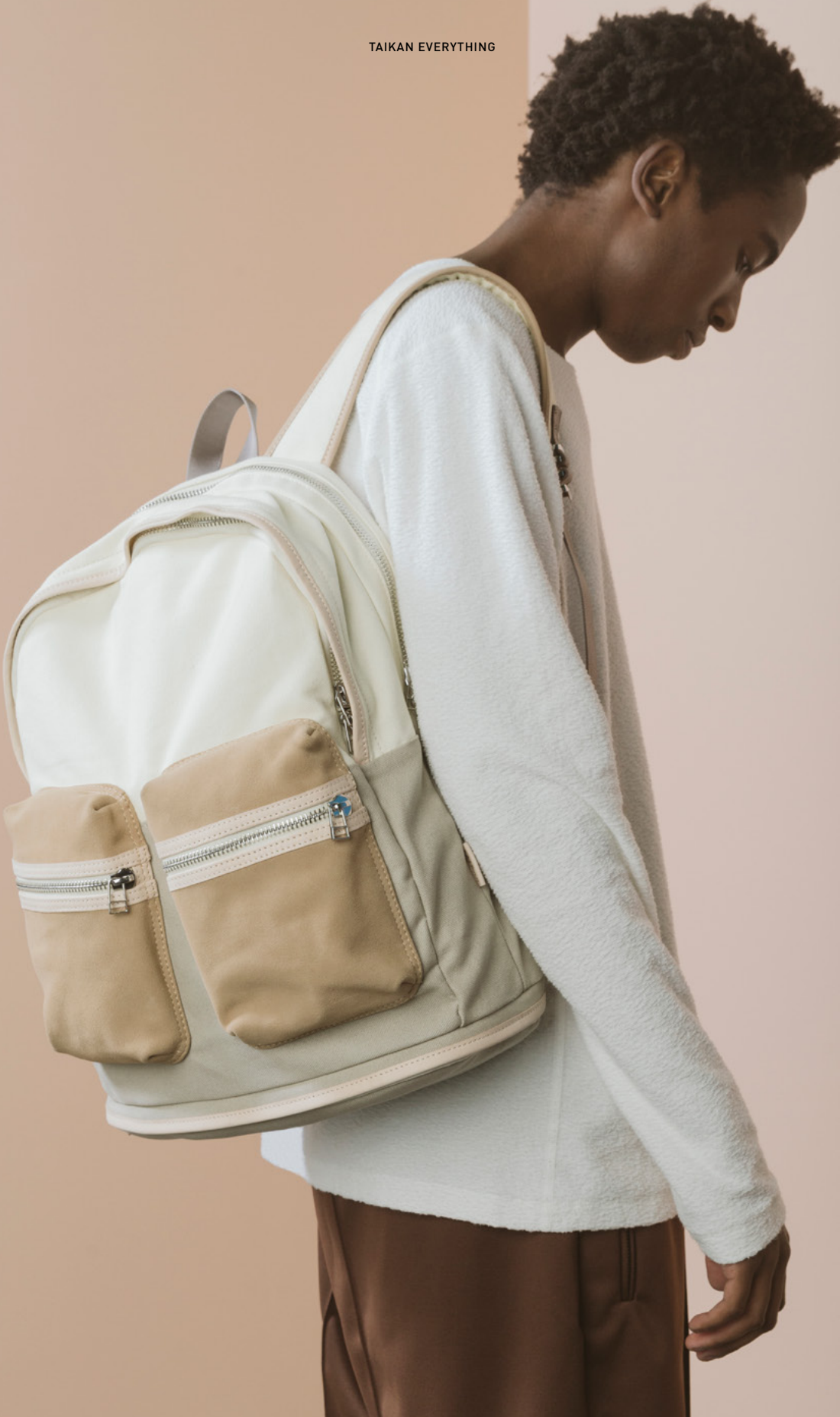
SPARTAN & SHERPA IN OFF-WHITE COTTON & VEG TAN LEATHER 160-5200 / 090-6400