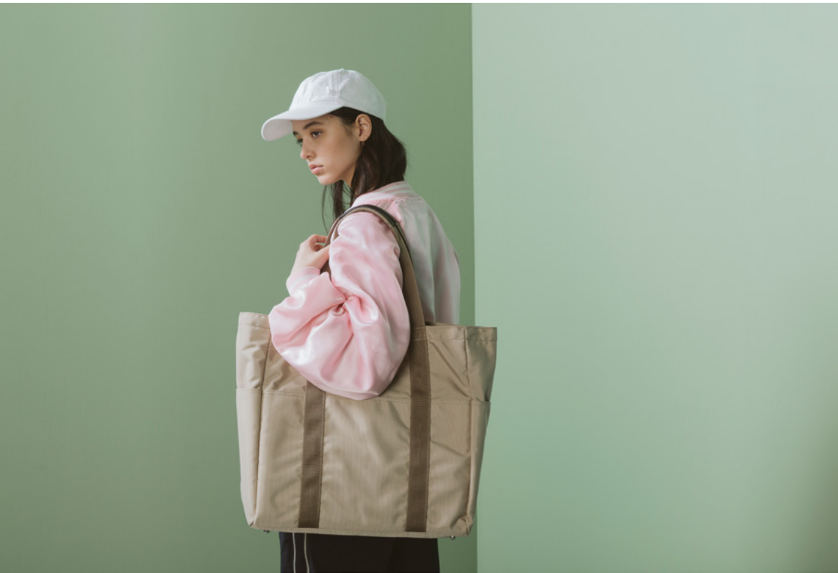
SHERPA IN MATTE KHAKI 030-5100